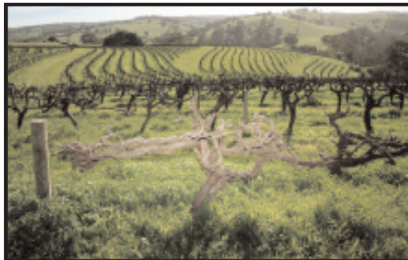
A vineyard of old-vine syrah on a beautiful day.

comes from a parcel that's called Andezon, and has historically been known for producing deep and rich red wines. The 2008 Andezon Côtes du Rhône is 90% syrah and 10% grenache with an average vine age of 40 (syrah) and 60 (grenache) years old. After fermentation in stainless steel, the wine sees no wood during its élevage, thus preserving the ripe and spicy primary fruit characteristics of these two classic Rhône varietals. Black cherry, licorice, and subtle notes of black olive make this entry level Côtes du Rhône a great choice with a grilled burger or a salumi and assorted cheese selection.