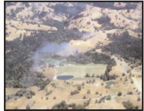
Wayfarer Farm Vineyard is tucked between two ridgelines a few miles from the Pacific.

Your re-order price for this wine as a club member is: Please inquire.