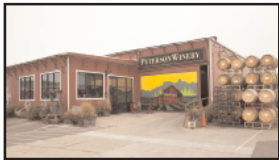
Peterson Winery, Dry Creek Valley.

Your re-order price for this wine as a club member is: Please inquire.