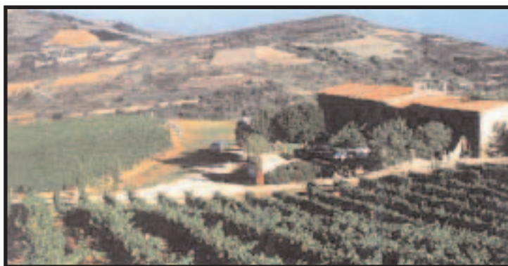
The Denois estate is near Limoux, in the foothills of the Pyrenees.

The 2004 Denois Merlot is a wonderful expression of a fresh Merlot style with plenty of fruit but just enough acidity to give it balance. The nose is dominated by plummy Merlot fragrance. On the palate the wine is medium bodied with lots of dark fruit, just a bit of earth and soft yet present tannins. This wine is an easy drinker, intended for consumption at an early age—so open it up and enjoy. It will go well with beef, pork or even roast chicken, and with hard cheeses.