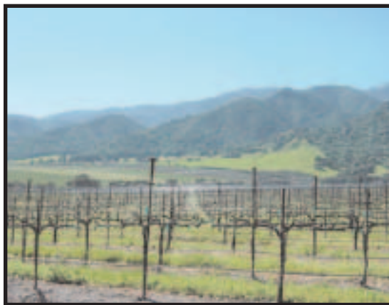
The Sleepy Hollow Vineyard in the beautiful Santa Lucia Highlands.