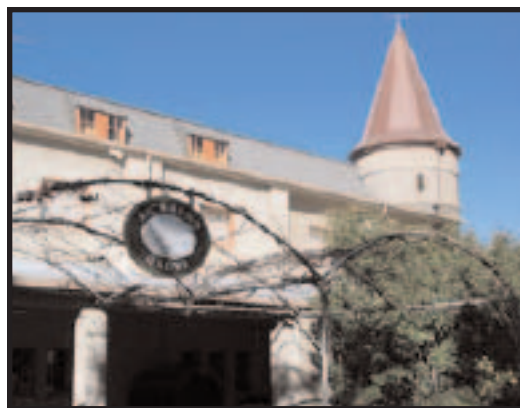
The historic Richmond Grove Winery in Australia's Barossa Valley.