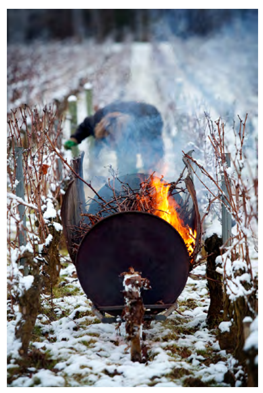
Winter in the vineyard at Malartic-Lagravière.

2009 Lagrange, St-Julien ($59.99) Do not attempt to drink this wine without first decanting for an hour! But if you do decant you will get soaring aromas of raspberries, blackberries and earthy potting soil in a muscular but caressing mid-palate with a huge mineral core. There is a deep and enveloping warmth to the ripe fruit and a full-bodied but gentle mouthfeel to the substantial middle. Decant a bottle tonight and lay another away for 20 years. 94 WE