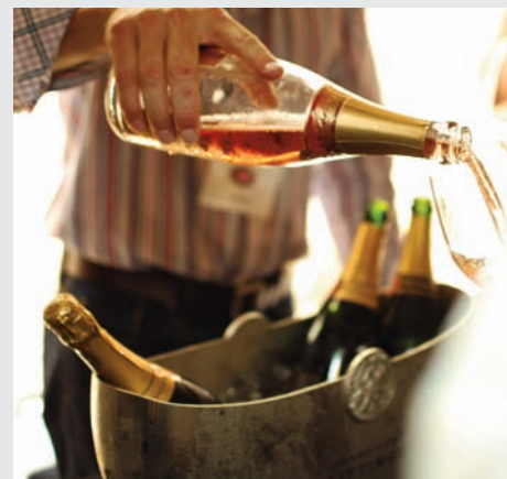
Taittinger glistening on ice.

For those of you looking for a creamier style of Champagne, the round and easy going Philippe Gonet “Brut Reserve” Champagne* ($34.99) is the perfect choice. Made in Mesnil, in the southernmost Grand Cru, this wine has a bit of everything from the Marne in it, but only from estate vineyards. It is composed of 60% Pinot Noir, 30% Chardonnay and 10% Meunier all vinified in stainless steel. It's one of my favorite apéritifs.