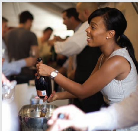
The Ruinart Rosé was a hit.