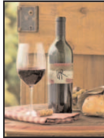
Long Meadow Ranch produces its wines organically and has created a sustainable agricultural operation.

The Signature Red Wines can be reordered for only $23.95 per bottle.