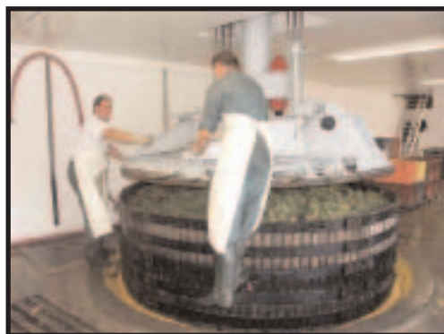
Pressing grapes at Barthelemy using a traditional Coquard press.

Here is a wonderful Champagne from a superb small négociant in Epernay. The Louis Barthélemy house was founded in 1923 by a Russian princess who fled the unrest in Moscow and settled in Epernay. It was later acquired by one of Epernay's oldest, most respected wine making families, the Lombard family. Lacking a direct descendent to carry on the business, the Lombards chose in 2002 to sell to another family business, JB Chancel, owners of the prestigious Château Val Joanis estate in the Lubéron. The Chancel family made investments to bring the house, with its miles of Crayères cellars, back to its former luster. Being new to Champagne, they were keen to continue to benefit from the Lombard family's three generations and more than 80 years of expertise. Members of the Lombard family are still employed to run the cellars and manage the long-term grape contracts.