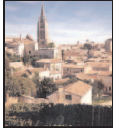
St Emilion is the one of the great wine villages of Bordeaux.

In 2005, Benoît Dubourg purchased Château Dubourg, a promising property in St. Emilion. The tiny estate (2.5 hectares or about 6 acres) is located at Saint Sulpice de Faleyrens, 4 km from the village of Saint Emilion. The fruit comes from old vines (around 35 years old) that are grown in an exceptionally favorable site with clay and gravelly, sandy soils. The vineyard is planted to 80% Merlot and 20% Cabernet Franc, fairly typical for the appellation. The wine underwent a traditional fermentation in thermo-regulated vats and was aged in 100% new French oak barrels for eight months. The result is a wine of beautiful color with a nose dominated by vanilla and dark fruits. On the palate, the wine has lots of both bright red fruits and darker fruit with good acidity and a bit of grip. The tannins are fairly well integrated but this wine will no doubt improve with a bit of bottle age. Do not hesitate to open it now, though, to get a peek at this much-heralded vintage.