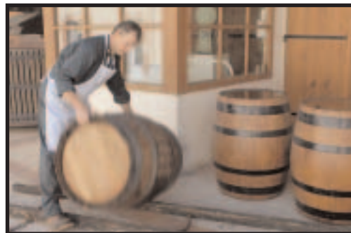
Barrel aging plays an important role in the complexity of the Mandois wines.