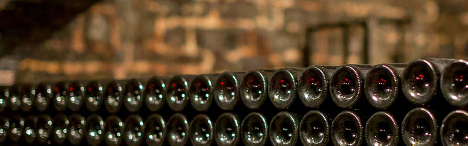
Traditional cellaring in Beaune.