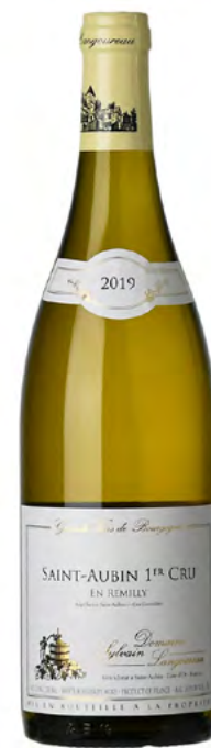
Terroir of St-Aubin.

One of the most pleasant surprises from this lineup is the 2019 Domaine Sylvain Langoureau St-Aubin 1er Cru “Bas Vermarain” ($39.99) . A real beauty, this wine has incredible balance—it feels light on the palate even though it possesses a wealth of orchard and citrus notes along with saline and wet stone flavors that seamlessly lead to a seductive kiss of oak on a surprisingly long finish. 91 BH