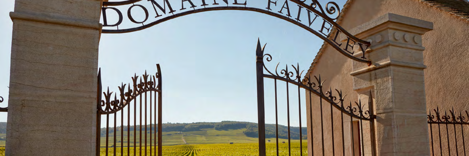
A view to a vintage.