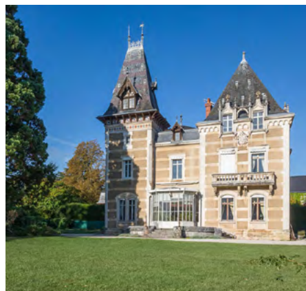
Le Château de la Creusotte, 123 years young.

The 2018 Domaine Albert Morot Beaune 1er Cru “Les Teurons” ($44.99) is a full-bodied offering with black cherry, vanilla, licorice, and spice notes all splashed across a glossy, ripe palate. This is a Burgundy that is ready to rock, with its copious amounts of black fruits and spice. 92 WE, 92 WS, 92 BH