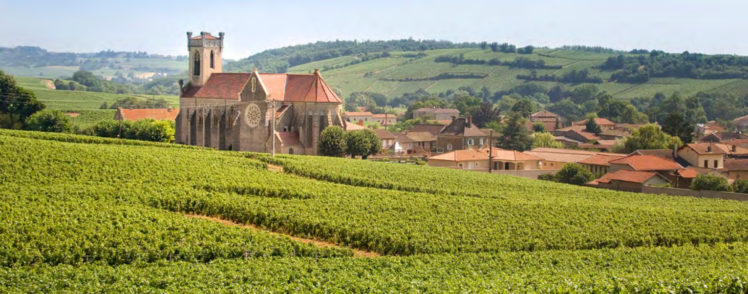
A sea of vines in the Mâcon village Fuissé.