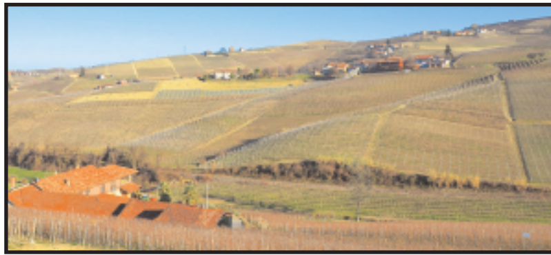
The spectacular east-facing amphitheater of the Ronchi vineyard, just east of the village of Barbaresco.

talk about but there's constant replanting going on. That's especially so in small vineyard holdings where there is a mix of new and old, so they always have something to produce. The 2016 Azienda Agricola Ronchi "Ronchi Barbaresco ($27.99) is aged in a mixture of large Slavonian oak botti and smaller barrels; this is the new trend for many Nebbiolo producers who have one foot in the old world style and one in the new. The blend gets the benefits of both. 2016 is a stellar vintage for Barbaresco and this wine will age for decades, but it is delightful now with a little bit of air. Enjoy!