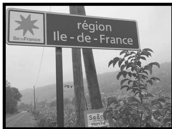
Champagne from the Paris district? I wouldn't have believed it if I hadn't been there myself!

Your re-order price for this wine as a club member is: $34.99 per bottle.