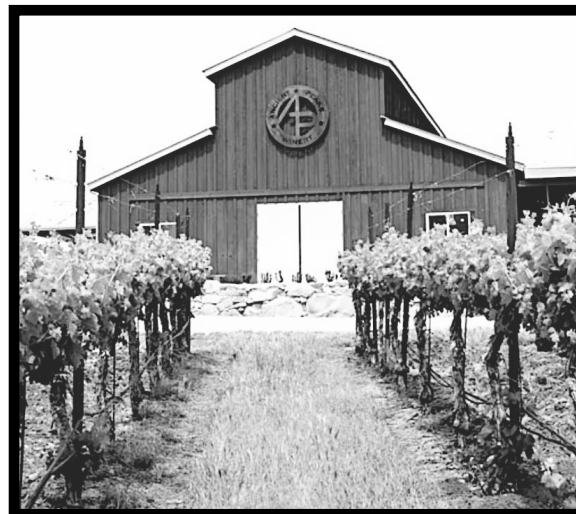
The barn at Ancient Peaks, Paso Robles.

Ancient Peaks burst on the scene about a decade ago with one of the highest rated inexpensive Zinfandels ever to come out of California. I was intrigued by the winery, wondering if they were just a tank farm, or a legitimate producer. In visiting them the following year I realized that they were firmly in the latter camp. Their sizable estate vineyard has to be seen to be believed, with its impeccable vineyard management, incredible diversity of soil types and singular microclimate that betrays the notion of Paso Robles's intense heat. Since that visit I have touted their wares and sung their praises to anyone who will listen.