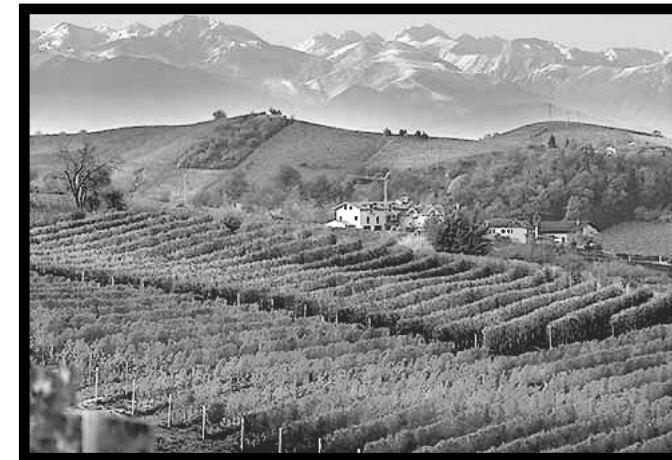
Vineyards of Poderi Luigi Einaudi, Piedmont.

One of the most important figures in Italian history was Luigi Einaudi, a humble Piedmontese man who rose to become the president of the first Republic of Italy, in 1948. Luigi was born in 1874 in the town of Carrù, just south of Dogliani and about 12 miles south of the town of Barolo. He worked as a newspaper reporter after earning a law degree at the University of Torino. He never let go of his agrarian roots; he always had time to focus on his estate. He died in 1961. Luigi Einaudi's estate is called Poderi Luigi Einaudi ( Poderi is plural for farms) and it is very large for the region, encompassing about 350 acres spread over eleven smaller estates, the largest holdings being in Dogliani with others sprinkled through Barolo and Barbaresco. The average vineyard holding in this area of Piedmont is about two and a half acres, so you can see that the Einaudi estate is on a larger scale.