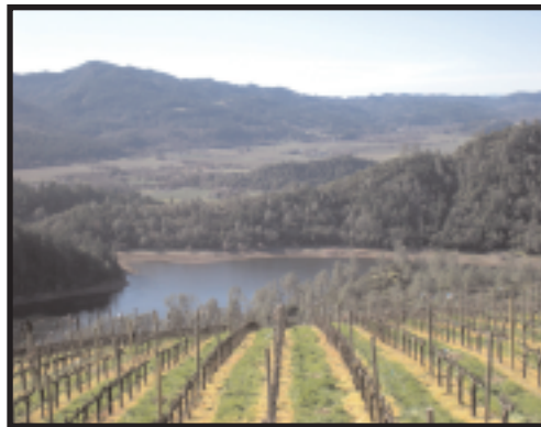
Vineyards at Stags' Leap Winery, Napa Valley.

Your re-order price for this wine as a club member is $13.95.