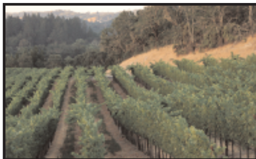
One of Lancaster's Alexander Valley vineyards.

Your re-order price for this wine as a club member is $24.99.