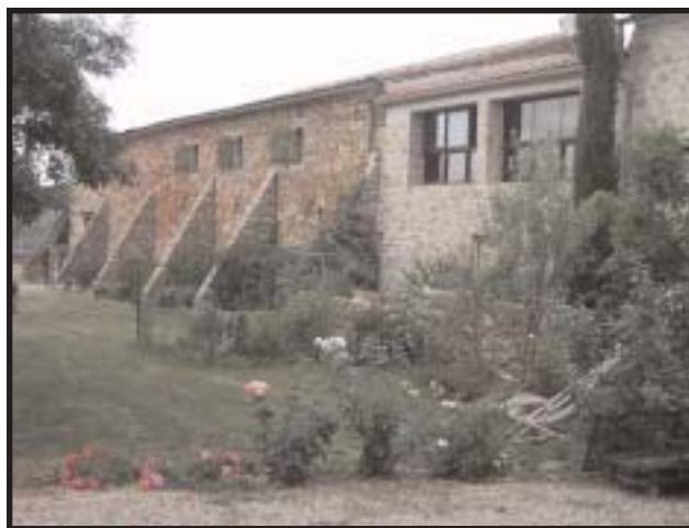
The Denois domaine. Lunch is often served on the veranda overlooking the garden. The tasting room is on the right, and the cellars are directly below.