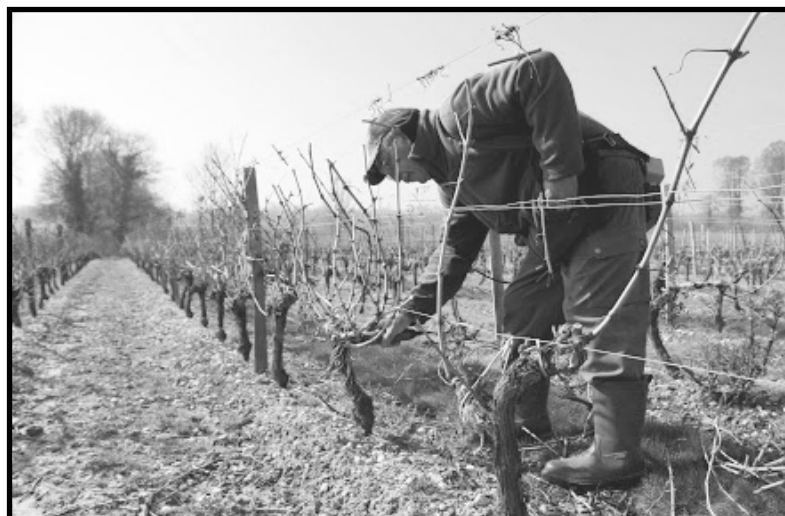
Weather is always a challenge to growing world-class Cabernet in Bordeaux's Medoc region, but 2016 was a fabulous vintage.

Another good way to compare these two wines is to taste them alongside food. It's amazing what a complementary pairing brings out in a wine, and it's fun to try a few different foods to really explore the potential of each wine. I'd recommend trying these with three very different foods: steak, blue cheese, and finally dark chocolate. I particularly liked the Napa Cabernet with the blue cheese, but each of these food combinations work quite well, and they highlight the various strengths of each wine.