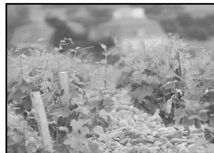
Just across the river from Châteauneuf-du-Pape, Lirac is an under-appreciated terroir with many qualities similar to its famous neighbor.