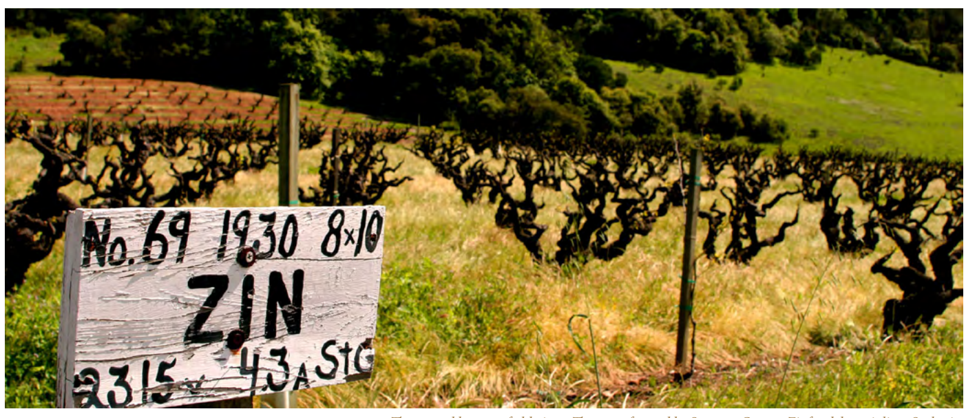
The rugged beauty of old vines. These are farmed by Sonoma County Zinfandel specialists, Seghesio.