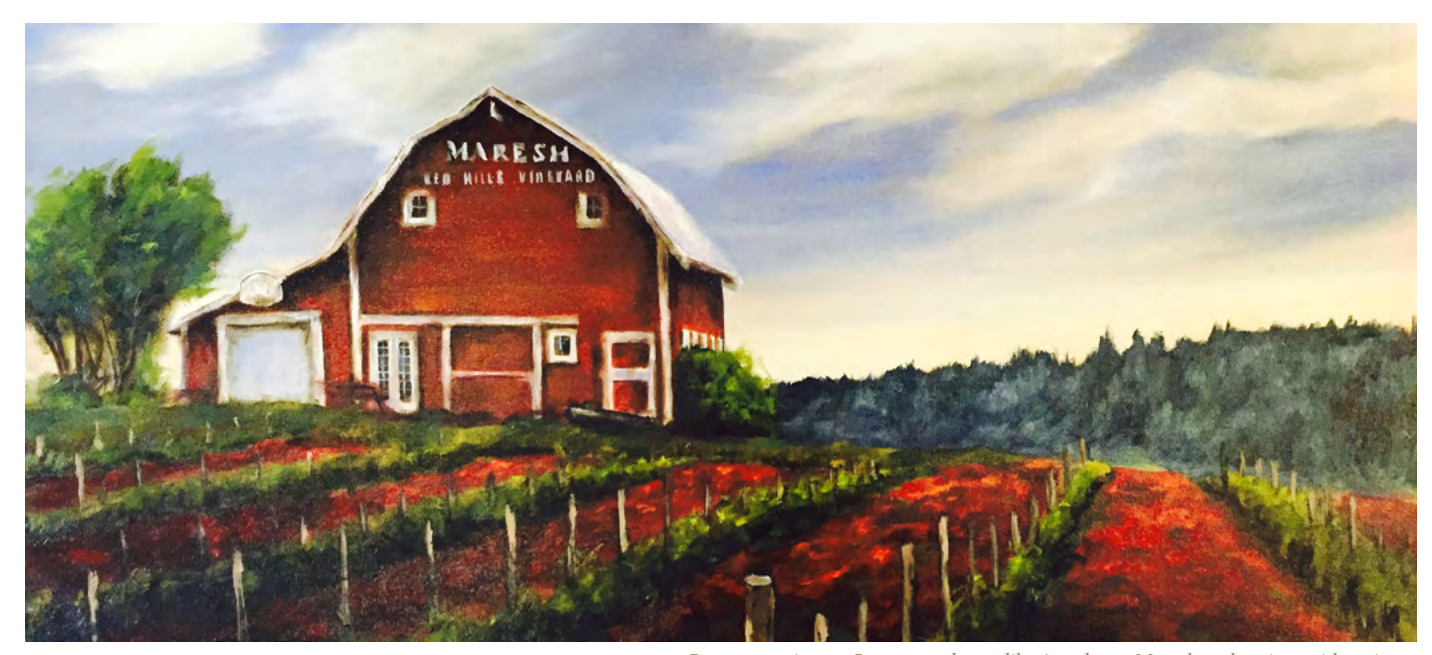
Pretty\ as\ a\ picture:\ Oregon\ producers\ like\ Arterberry\ Maresh\ make\ wines\ with\ artistry.