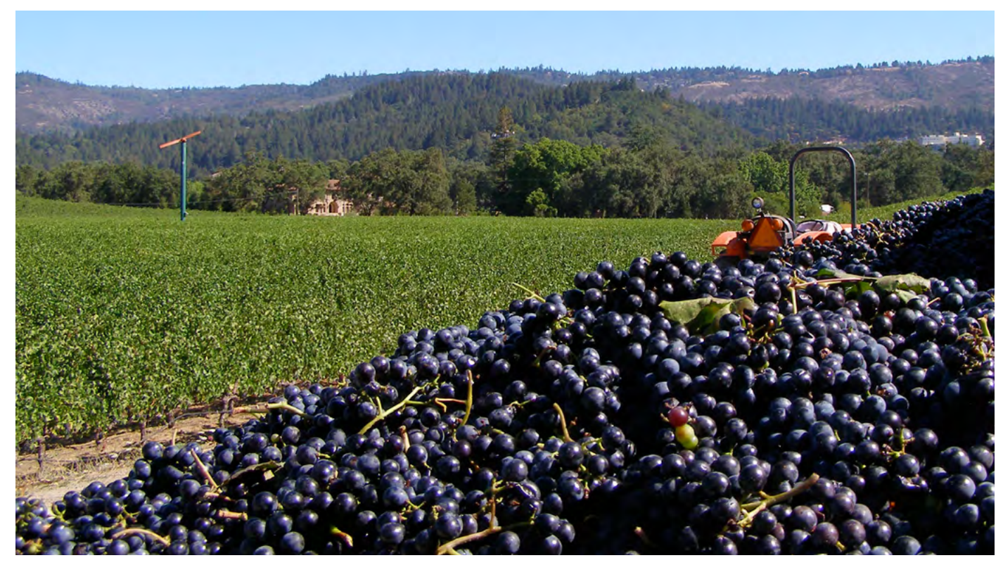
Biodynamically grown grapes piled high at Ehlers Estate, a few vintages back.