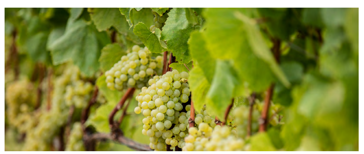
Chardonnay ripens in the sun, destined for another delicious bottle from DuMol.

Chardonnay ($99.99) Broad and expansive Chard. Lovely weight on the palate with soft yet persuasive acidity. Drinking beautifully with a few years in bottle. 94+ RP, 93 VN