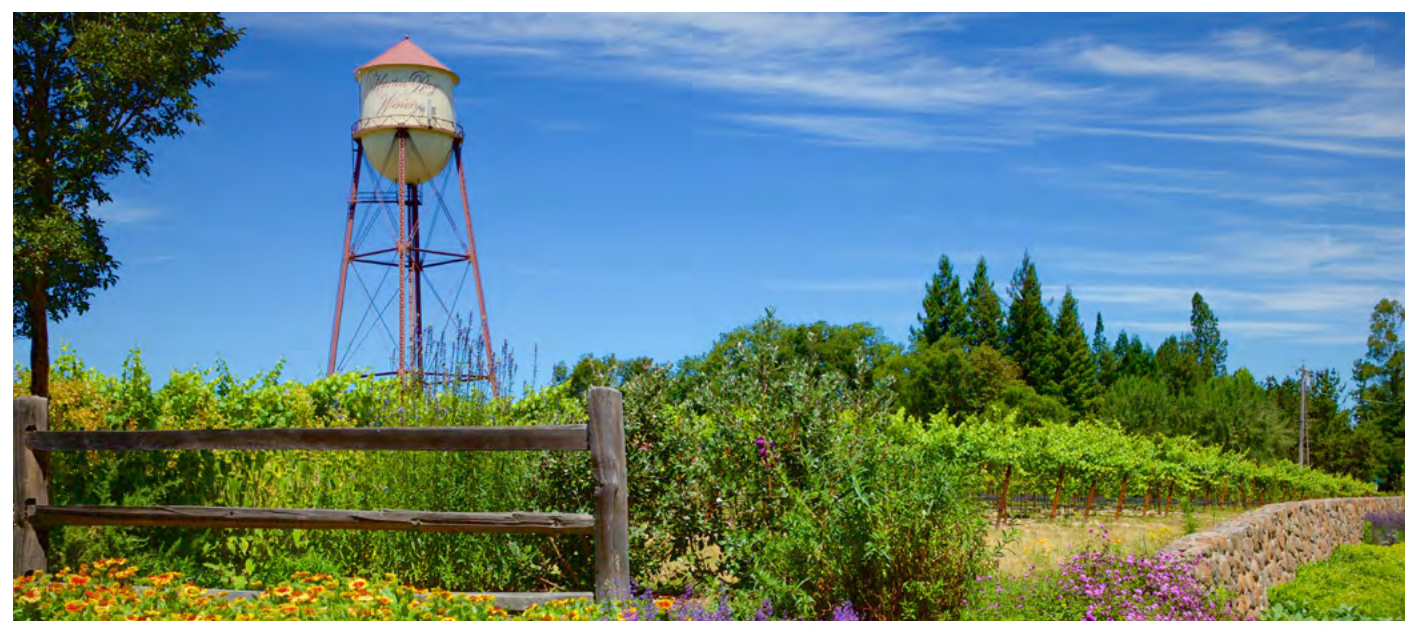
Beautiful deal: We can offer Martin Ray Winery's appellation Pinot for a song.