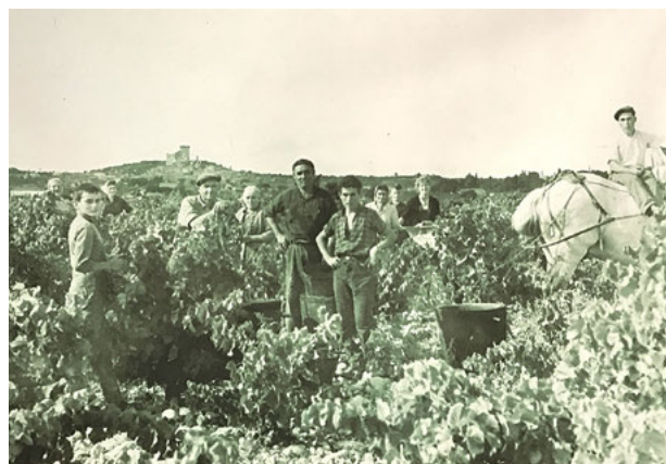
Historical scene from the Giraud family in Châteauneuf-du-Pape.

2015 Domaine de la Janasse Châteauneuf-du-Pape Vieilles Vignes (PA $89.99) 94-96 RP, 94-96 VN