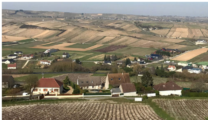
Farmland and vineyards of Sancerre.