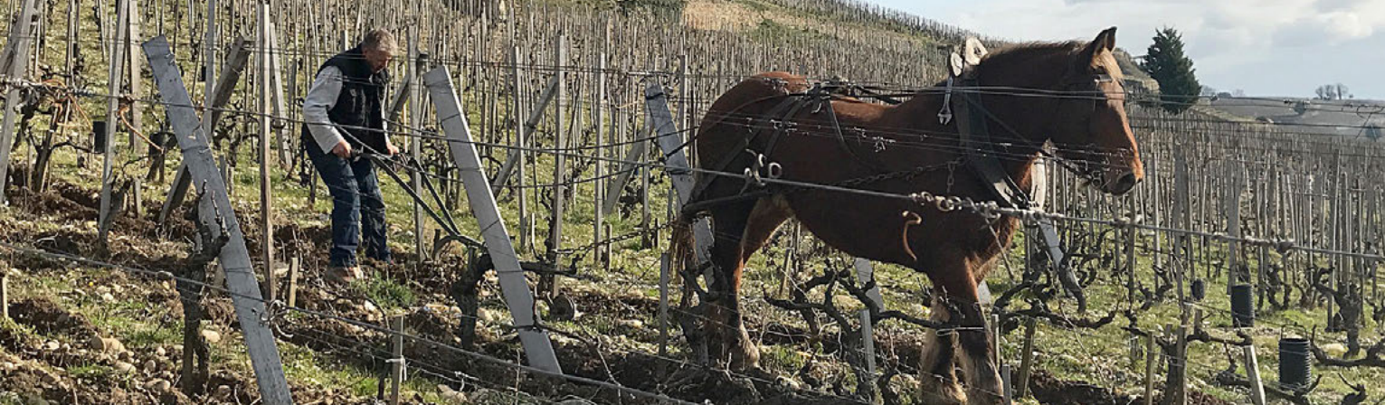
Plowing the hill of Hermitage.