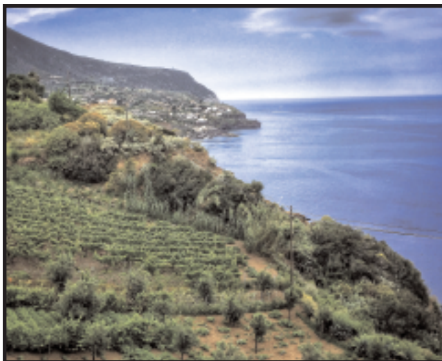
Caravaglio's Malvasia vineyards on the Aeolian Island of Salina.

Roberto Rossellini and Ingrid Bergman... I never thought I could start a Wine Club article with those names. This month's white wine is from the island of Salina, one of the Aeolian Islands off the north coast of Sicily. Stromboli, a famous name thanks to the 1950 movie that Roberto Rossellini directed and Ingrid Bergman starred in (their romantic offspring, actress Isabella Rossellini was spawned during the filming), is one of the other islands in the small chain of Aeolian Islands.