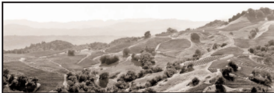
Stonestreet has dozens of mountain vineyards at varying altitudes, soil types and exposures.

In my 20-plus years in the wine business I have visited countless wineries and estates in California and Europe. One of the most impressive places I have visited and tasted at was Stonestreet winery. I am telling you right now, Stonestreet is a name to remember. They are