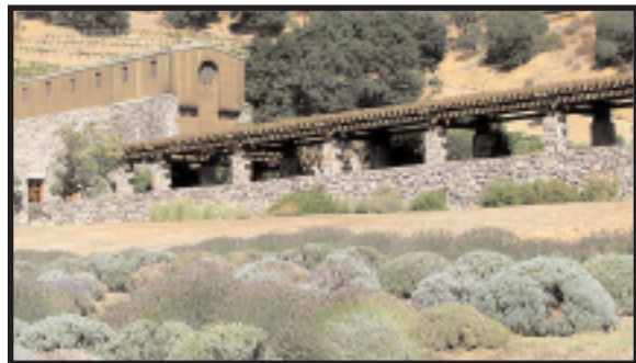
Simi Winery in Sonoma, founded in 1876.