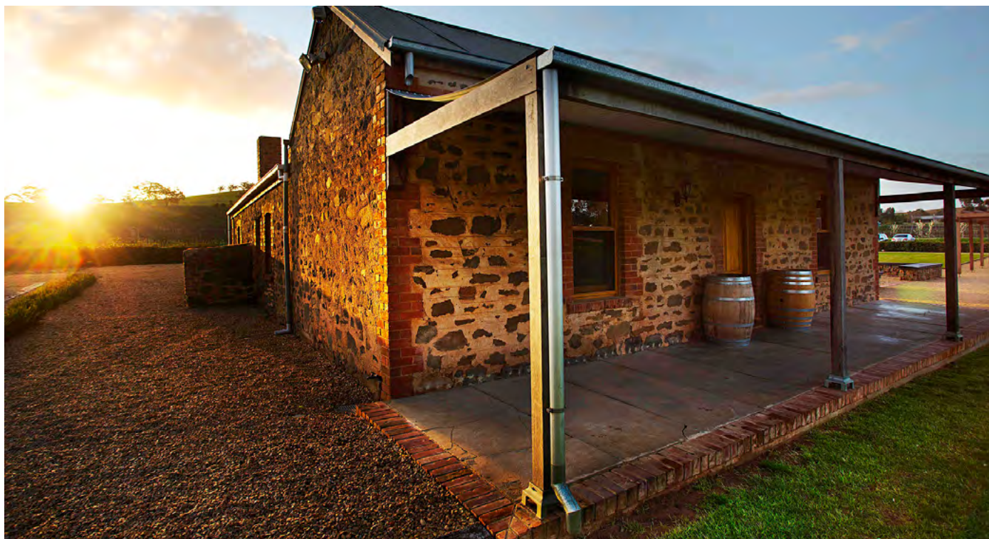
Cellar door at Hentley Farm.