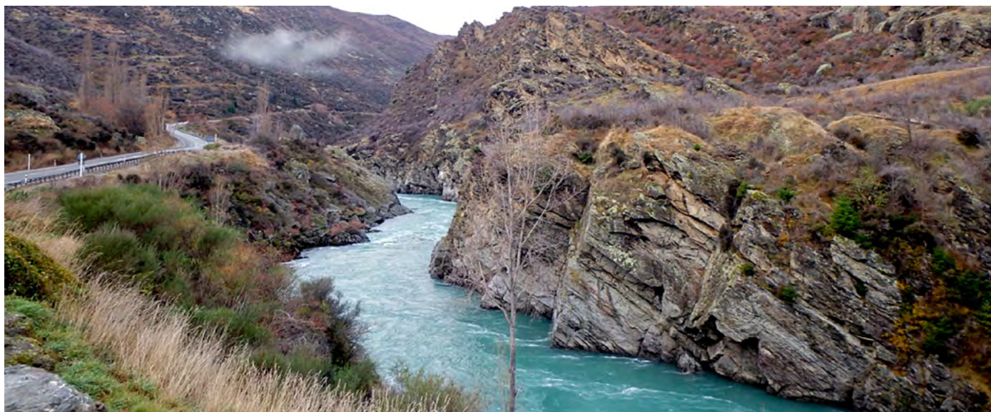
The dramatic Gibbston Valley, home to Valli.