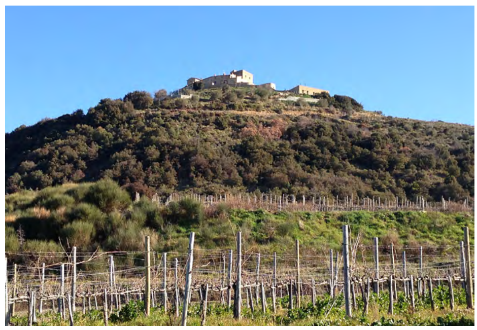
Montalcino's southern edge from the Castello di Velona.

Guido: Collemattoni delivers a mix of black cherry, ripe raspberry and cocoa aromas and flavors, picking up spice and tobacco elements on the very long finish. This is to drink now and over the next few years. Stock up with this Brunelli while you can. 1,833 cases produced. 92 points JS.