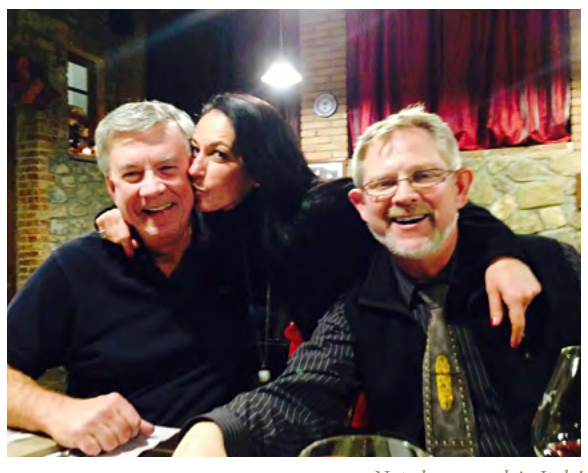
Not always work in Italy!

PA) 4.5 stars ****1/2 The nose is full of sweet plummy fruit, wild cherry, earth, Tuscan dust, smoked meats and herb, all flowing gently from the glass giving one the sense of ease and grace, not forceful but full. In the mouth the wine shows a lush, full expression, almost chocolaty, with plum and herb and earth, a supple, warm and inviting palate presence that just begs to be drunk, yet for a wine so easy to drink it shows remarkable depth and definition. The finish is long lasting, and carries through the chocolaty, cherry, dried herb character, but it's the texture, that luscious, lustrous broad power that catches your attention and makes you go back for another taste.