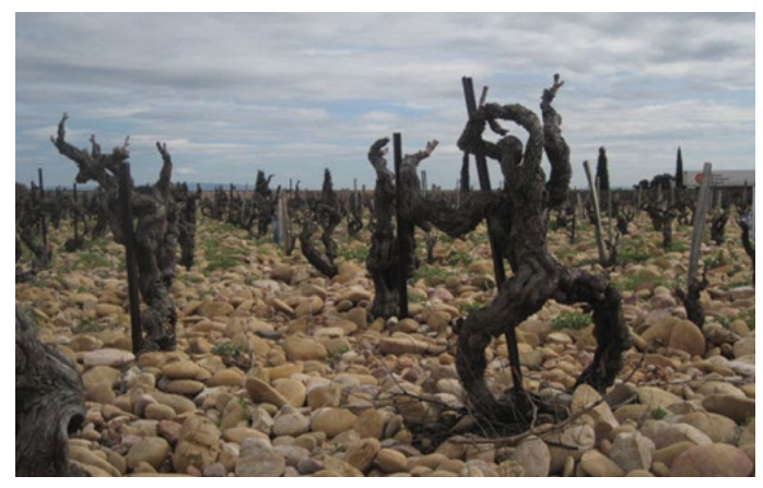
The famous stone-laden vineyards of Châteauneuf-du-Pape.

The year started off with a very cold and dry winter followed by significant frost in February. Unseasonably cool and rainy weather through spring led to late and uneven flowering throughout the region. Fortunately, the summer months were essentially dry and sunny with no major rainstorms or meteorological incidents