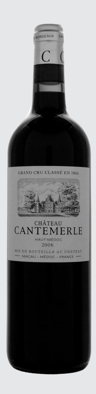
"Ch. Cantemerle showed why Clyde and I believe this is the #1 Best Buy of the entire vintage, a complete wine with lovely texture."